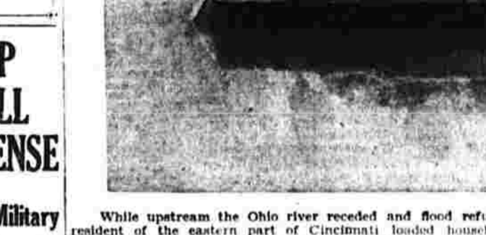
To Smile at Jolson