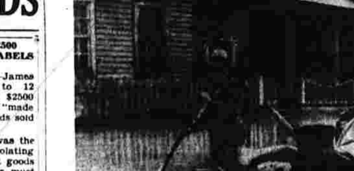
While upstream the Ohio river receded and flood refugees were returning to their homes, this aged resident of the eastern part of Cincinnati lashed his boat-hungry belongings into a boat and fled the menace of rising water. In some sections of the city WPA trucks were used to remove families from the Ohio's path.