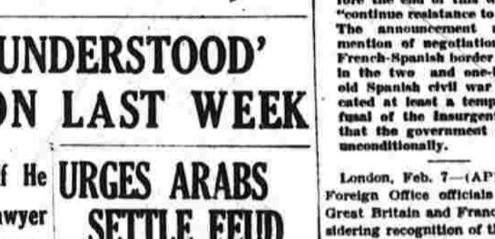
LEVY 'MISUNDERSTOOD' QUESTION LAST WEEK