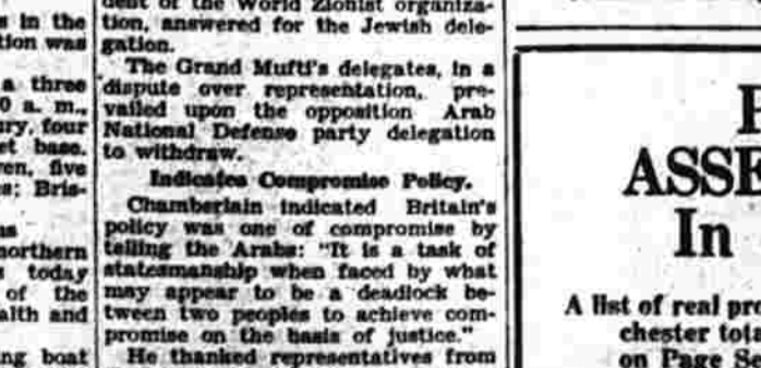
PROPERTY ASSESSMENT LIST In Herald Today

London, Feb. 7.—(AP)—The Spanish government today announced that it would recognize the government of Generalissimo Franco as the sole official government of Spain.