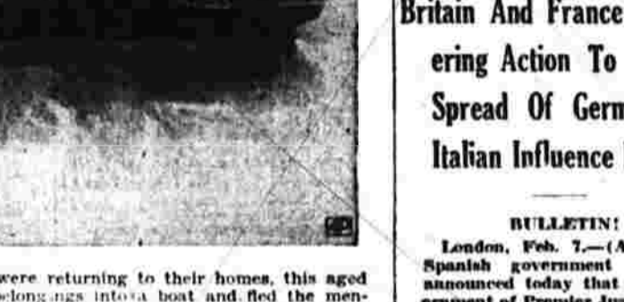
STATE SOLONS CREATE FLOOD CONTROL UNIT