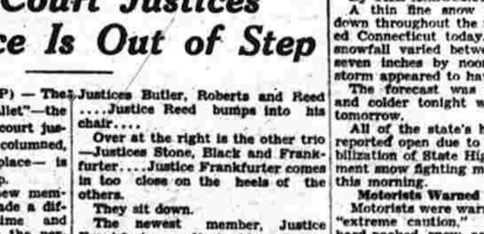
THIN FINE SNOW BLANKETS STATE